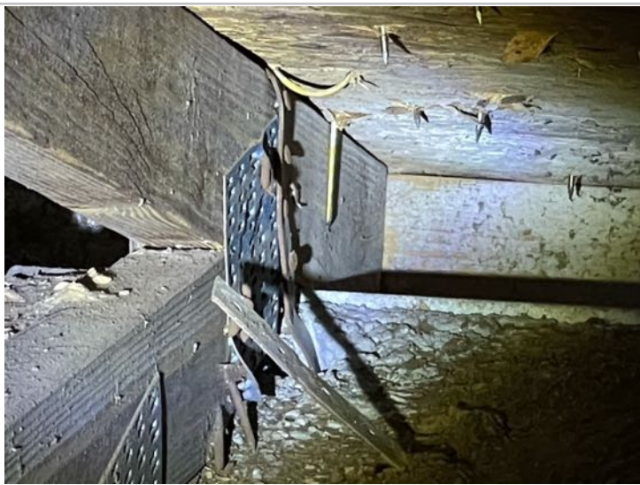
Strap- Anchor Side