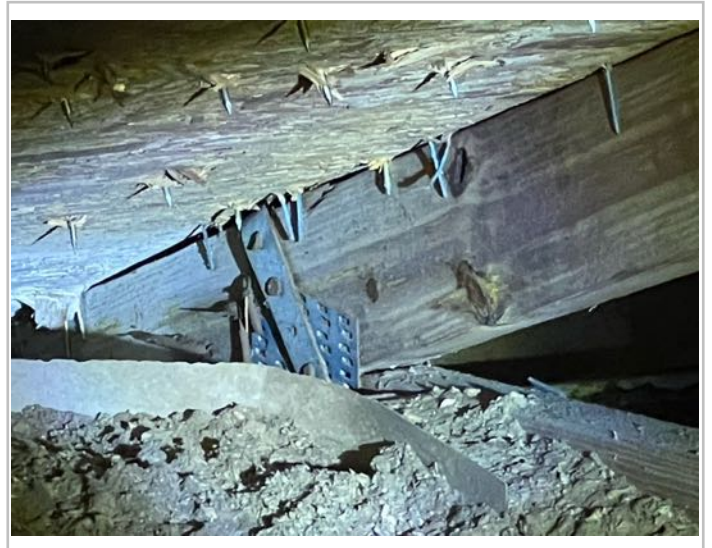
Strap- Opposing Side